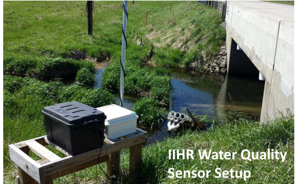
IIHR Water Quality Sensor Setup